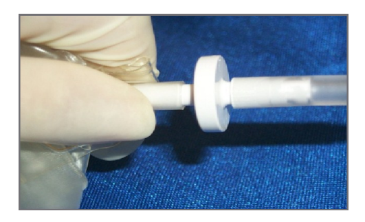
Using the nondominant hand, grasp the port between thumb and index finger.

Note: When inserting the spike into the port, do not twist more than a 1/4 turn at a time.