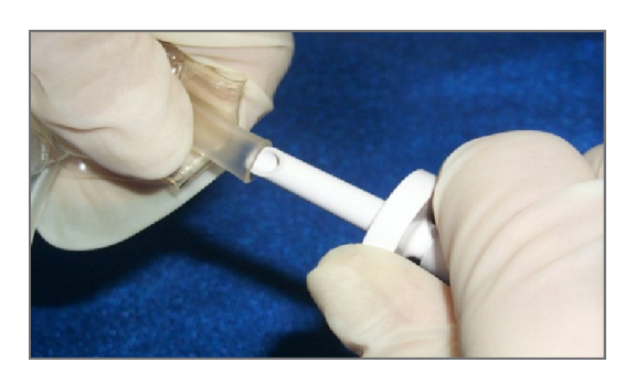
When the spike has loosened from the port, pull the spike straight out to remove it.