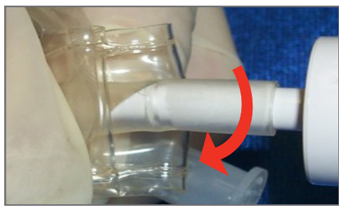
With the dominant hand, grasp the spike.