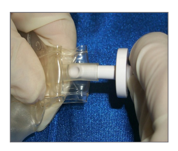
Insert the spike firmly into the bag port, up to the septum in the port. Pierce the septum, but do not over spike: push the spike, twisting it clockwise no more than a ¼ (90°) turn.